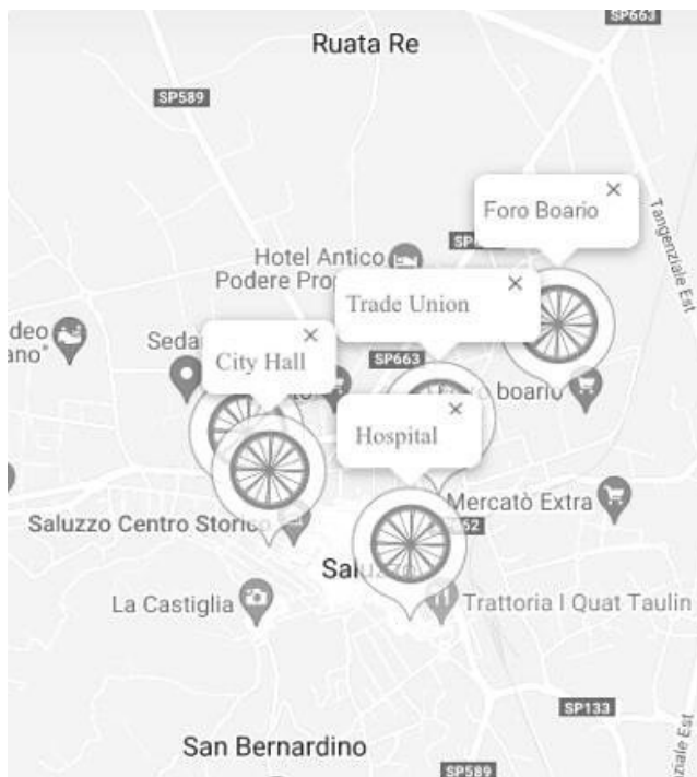
FIGURE 2 Map of the city of Saluzzo with some points of interest for migrant farmworkers.

the municipality of Saluzzo, as institution, entered the field autonomously by renovating an old military building and creating a hub [Foro Boario] not only to accommodate people in Saluzzo but also to use this as the main center [for workers relocation]; if the workers had the contract in nearby municipalities, they were moved in these other minor centers in the “widespread reception” (“accoglienza diffusa”). (Int.1, social worker)